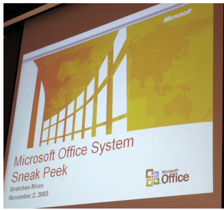
Gretchen counts off all the new features of Office Suite 2003