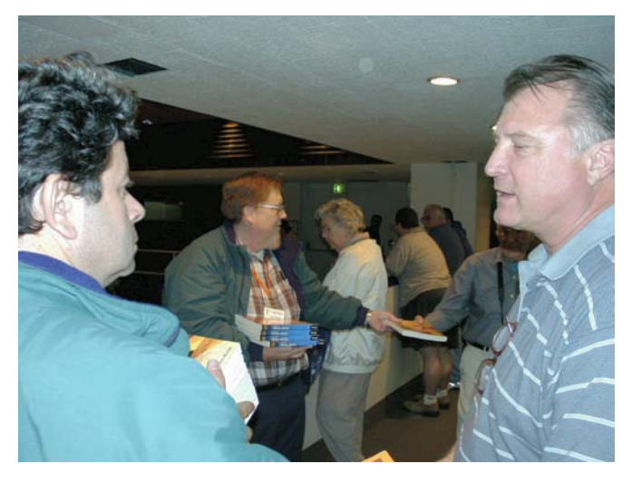
Microsoft gave everyone at the meeting a free copy of the book "First Look Microsoft Office 2003"