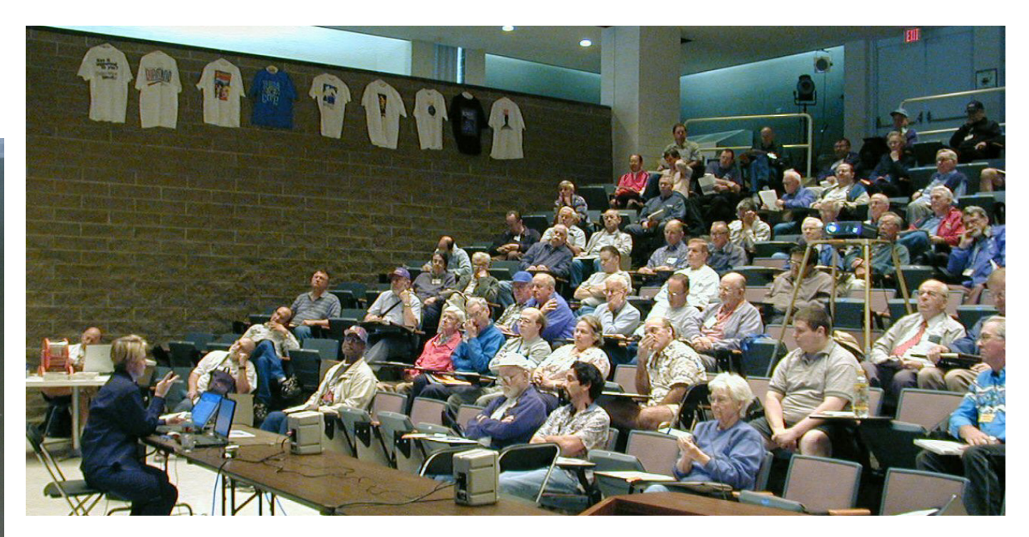
Drawing for the winners