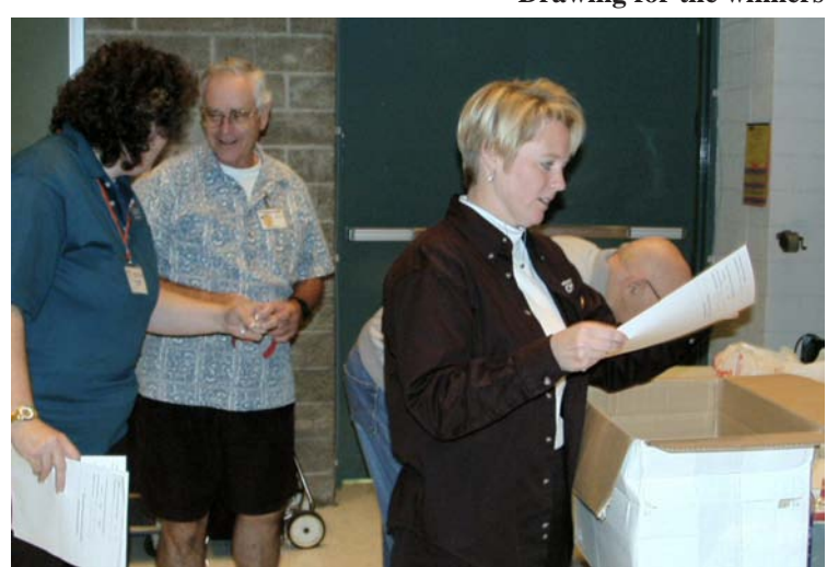
A couple of happy Office winners